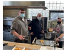
All sales benefit St. Paul School

St. Paul School OLD-FASHIONED LENTEN FISH FRY CARRY-OUT ONLY FRIDAY, FEBRUARY 26, 2021 PICK UP BY APPOINTMENT 4:30-6:30PM BEHIND THE SCHOOL PLEASE CALL OR PRE-ORDER ONLINE BY 2/23