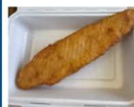
Giant 8oz Beer Battered Fish

St. Paul School is bringing back the LENTEN FISH FRY on FRIDAY 2/26! Please reserve your meals (carry-out-only) by calling the office at 330-337-3451 or online at http://tinyurl.com/SPSFishFry . Choose from our 3 meals ($12 8oz beer-battered fish fillet meal, $12 8oz broiled fish fillet meal, or $6 mac & cheese Meal)--all with delicious sides! More details below! Food will be prepared by St. Paul School teachers/staff in order to raise much needed funds for our school! This is a great way for everyone to enjoy some delicious food while helping local students! Please feel free to share to help get the word out!